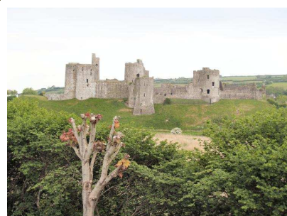
View of castle

PLEASE NOTE: Neither services nor appliances tested by Agent. THORNES for themselves and for the Vendors or Lessors of the property whose agents they are give notice that: